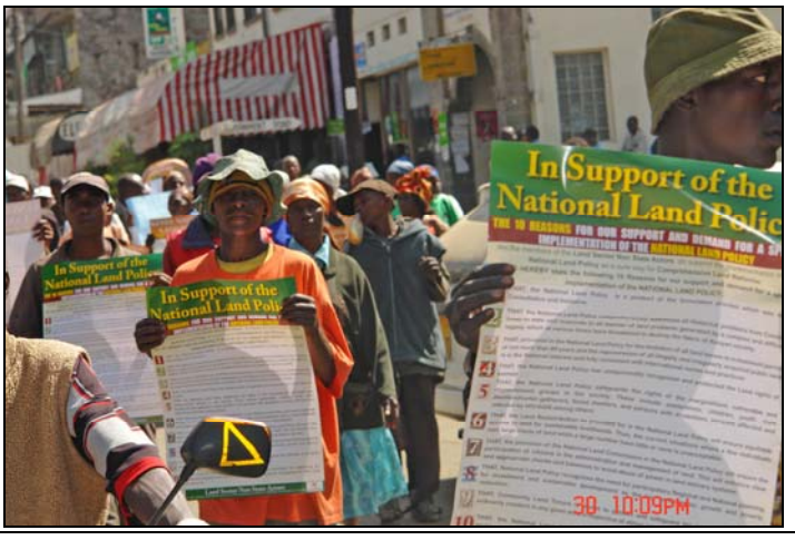
Photo 1: Road Show prior to the launch of the "The People's National Land Policy" on 26th June 2009.

INV 4 – Land Policies in Africa Mwenda Makathimo and Makena Kaaria-Ogeto Participation of Surveyors in Land Policy Formulation in Kenya: Examination of Best Practices (4663)